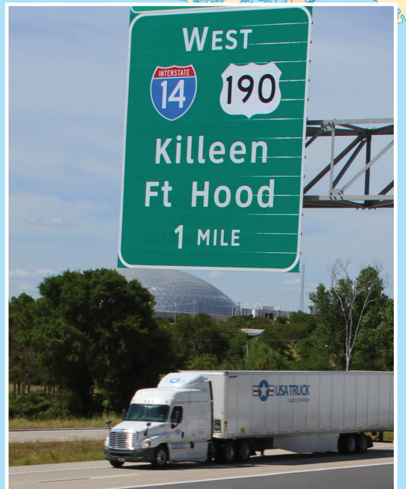
25 Miles of I-14 west of I-35 was added to the Interstate Highway System in 2017

Connecting U.S. Army Facilities and Texas Military Strategic Ports